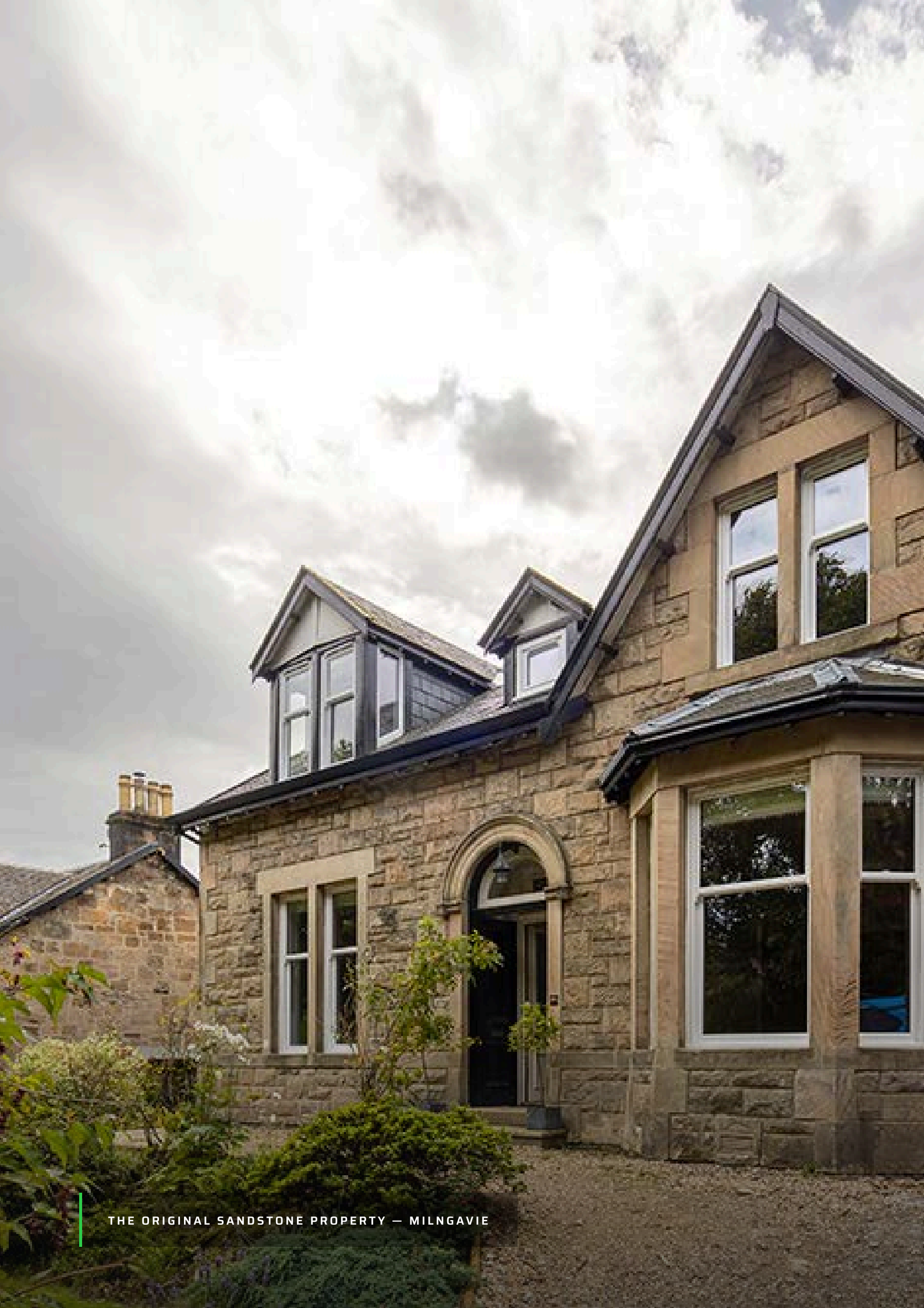
THE ORIGINAL SANDSTONE PROPERTY — MILNGAVIE